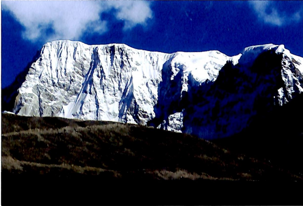
Chummankang (6212 m) from north.