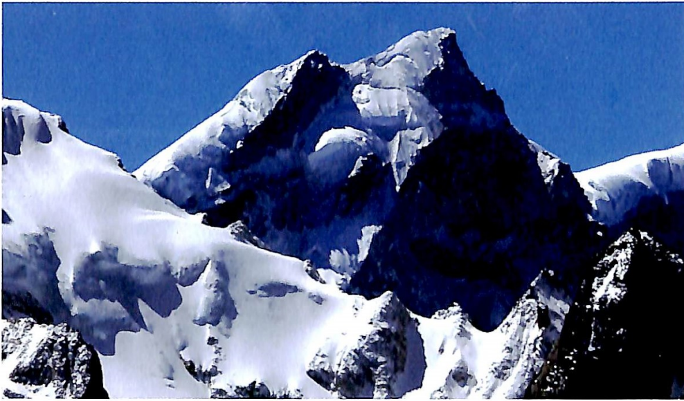
Unnamed 7000 m peak seen from the Plateau. (Harish Kapadia)

scene was best described by White. ‘There is something exhilarating in these high altitudes, the tremendous expanse of snow around gives a feeling of freedom not experienced at lower elevations, while there is always a fascination in arriving at a summit of a mountain, ( or a pass ) particularly when the unknown is on the other side.’ ( Italics mine ) 8