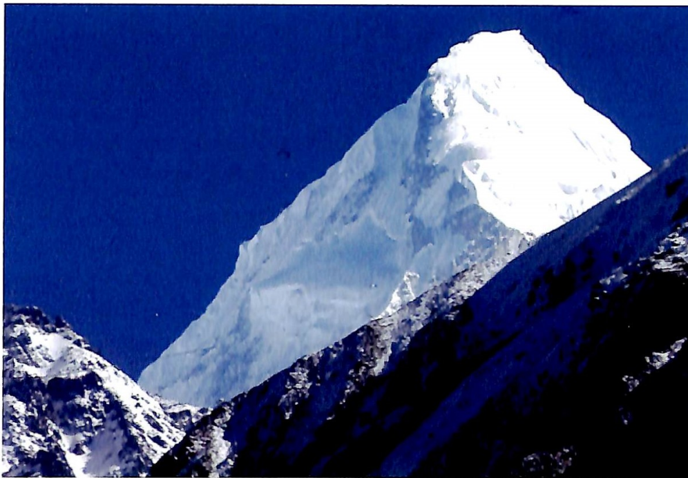
P. 7032 m from south.