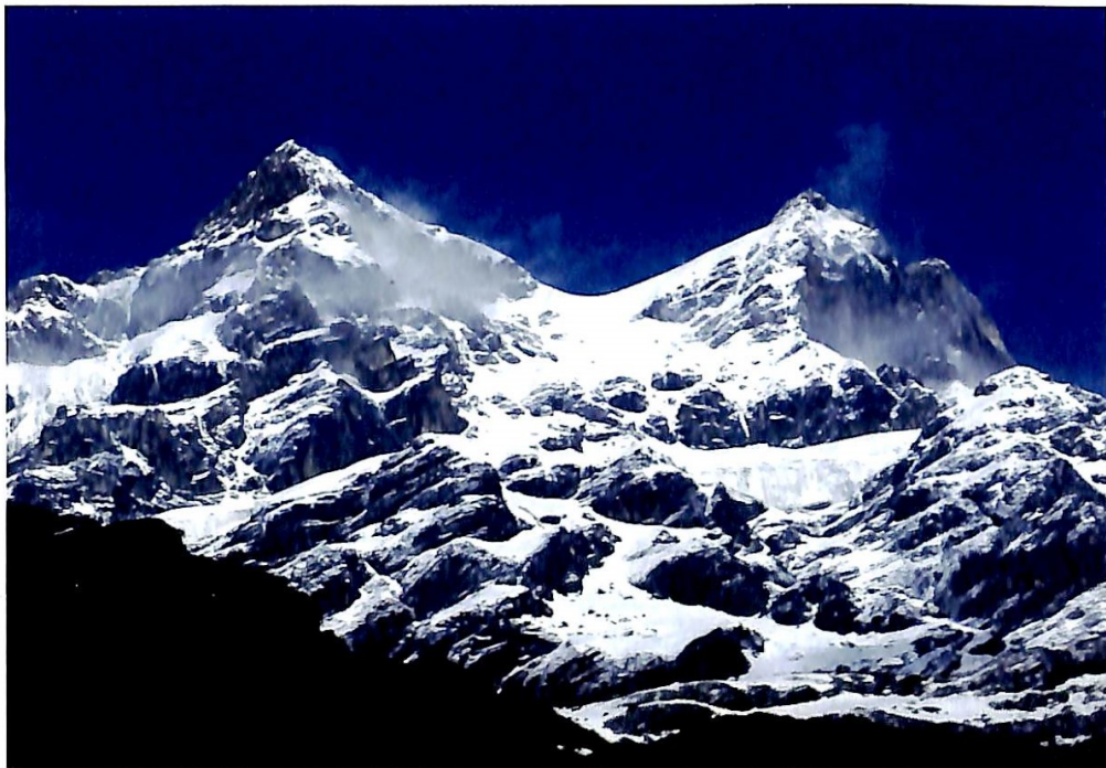
Lama Angden peaks (5868 m) above Lachen.