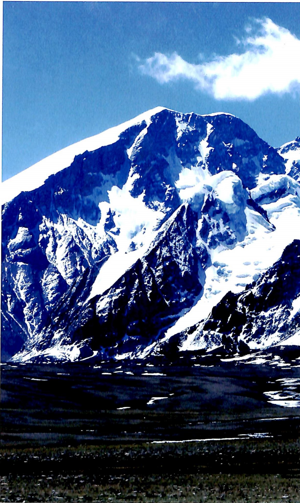
Pauhunri (7125 m), highest peak on the Plateau. (Harish Kapadia)