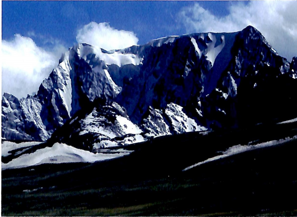
Kangchenjau (6889 m) from the Plateau. (Harish Kapadia)

perished on the mountains. There was no sign of this log book at any forest establishments till Gangtok. The system of 'Phipun' (village headman) was prevalent but now it was an elected post within the village.